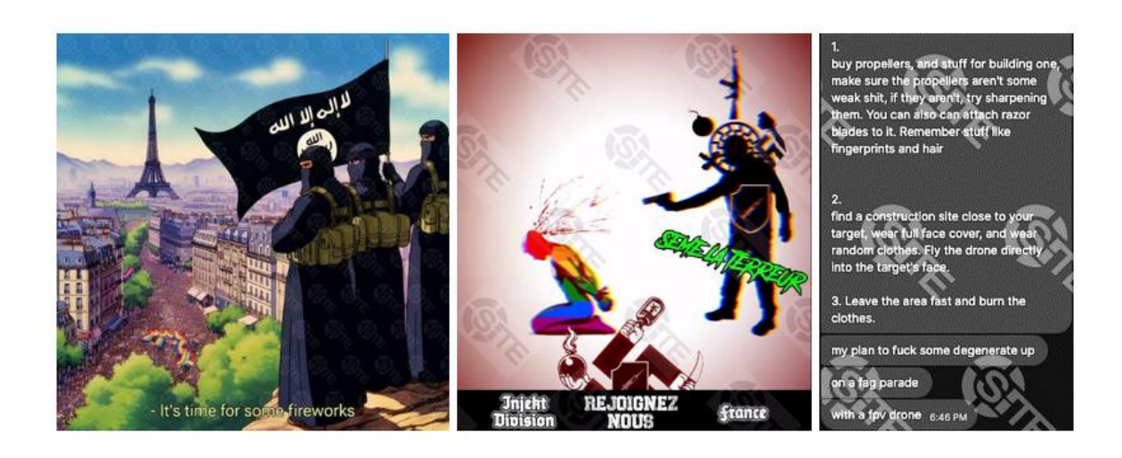
Extremist Propaganda Targeting LGBTQIA+-Events