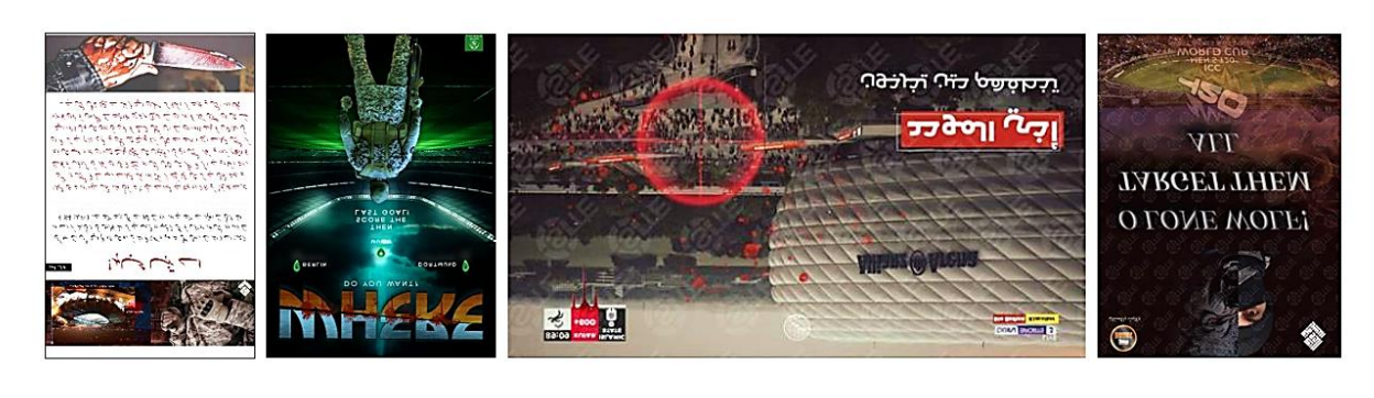
Terror Propaganda Targeting Sporting Events & Facilities