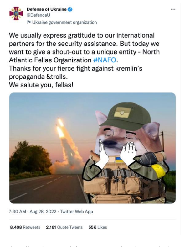
Post by the official page of the Ministry of Defense of Ukraine on X

5. Political persuasion in digital war. In the Russia-Ukraine war, memes have become tools to enhance information tactics. In 2022, the North Atlantic Fellas Organisation, or NAFO, was featured by Politico , illustrating the approach of internet agents in utilising memes and humour in information tactics. These "fellas" on the internet weaponised memes to engage in digital warfare, coordinating social media offensives with humour to rally Ukrainian and international support by mocking the Kremlin and countering their online narratives. Additionally, Ukraine's Defence Minister Oleksii Reznikov publicly acknowledged and supported the NAFO efforts, and showed this by changing his profile picture to a Shiba Inu carrying a Ukrainian shield. "Meme wars" can be waged by various actors using seemingly harmless and humorous images to infiltrate the information space and mind space of the populace. These memes could complement military strategies while bolstering widespread support for the war, as found by research from Brookings Institution .