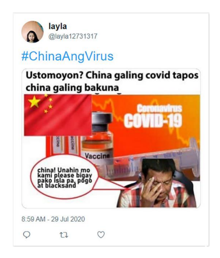
Example of alleged anti-vaccination propaganda campaign in the Philippines reading "#China is the Virus" and "Do you want that? COVID came from China and vaccines came from China"